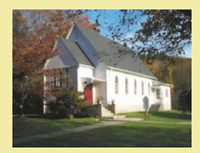
SAINT PATRICK Roxbury, CT