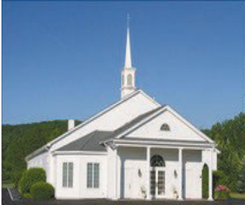
Our Lady of the Lakes Church Sullivan Road New Milford CT 06776