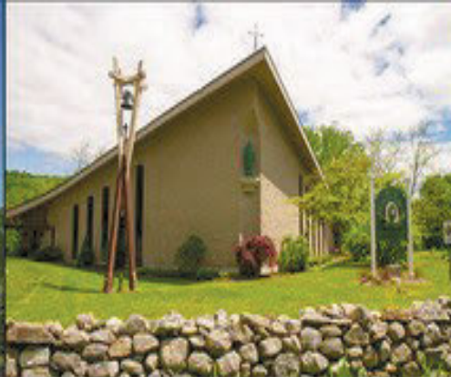
St. Francis Xavier Church 26 Chestnut Land Road New Milford CT 06776