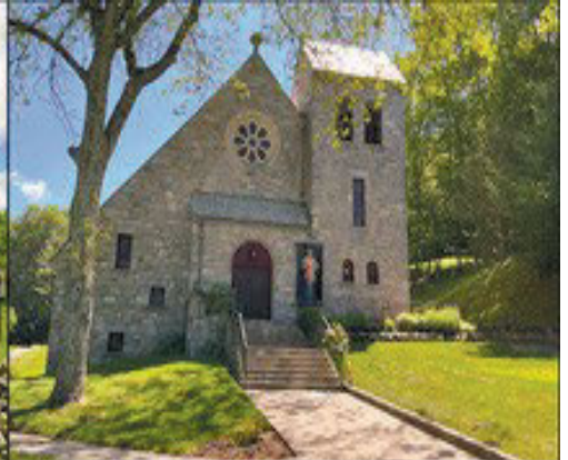
Our Lady of Perpetual Help Church 34 Green Hill Road Washington CT 06793