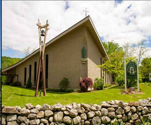
St. Francis Xavier Church 26 Chestnut Land Road New Milford CT 06776