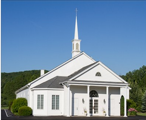
Our Lady of the Lakes Church 30 Sullivan Road New Milford CT 06776