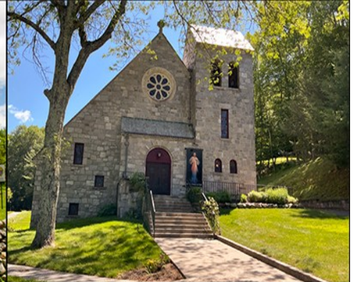
Our Lady of Perpetual Help Church 34 Green Hill Road Washington CT 06793